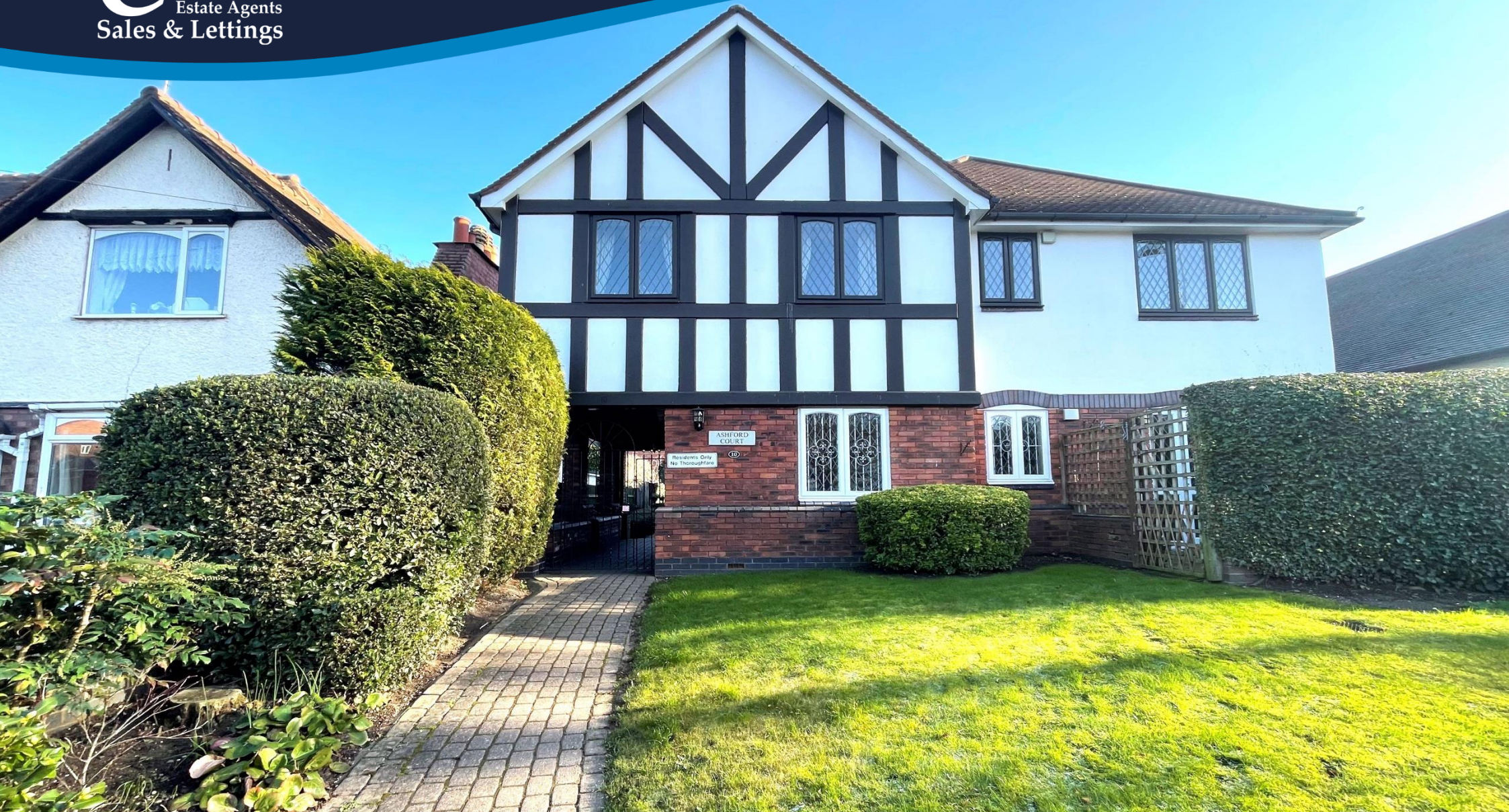
Ashford Court, Walmley Road, Sutton Coldfield, B76 1QN